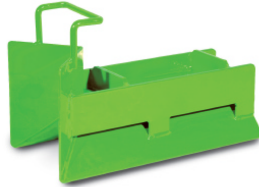
Ram Support Dimensions: 40 x 19 x 25,5 cm Weight: 9 kg