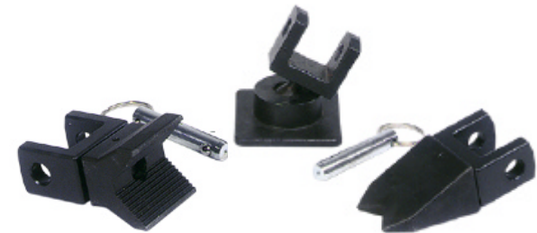
Accessory Set Swivel: V-Head: 12 x 7,5 x 7,5 cm Weight: 2 kg Pointed Head: 16,5 x 4,5 x 7,5 cm Weight: 2,2 kg Extended Base Swivel: 11 x 11 x 12 cm Weight: 2,7 kg 2 x Pin with Ballspring