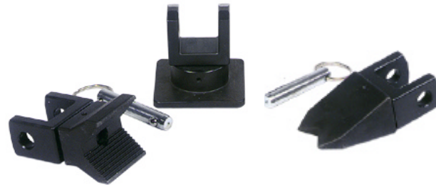
Accessory Set Fixed: V-Head: 12 x 7,5 x 7,5 cm Weight: 2 kg Pointed Head: 16,5 x 4,5 x 7,5 cm Weight: 2,2 kg Extended Base Fixed: 11 x 11 x 11 cm Weight: 2,7 kg 2 x Pin with Ballspring